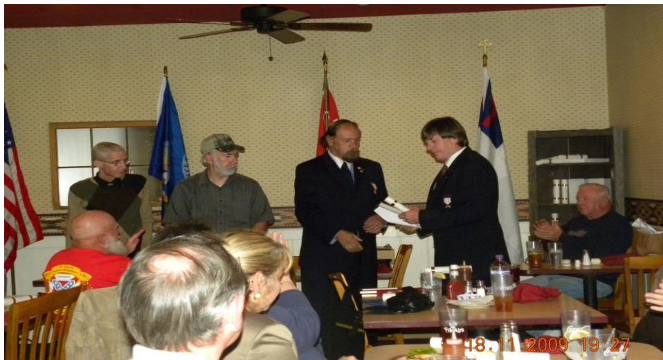
2009 Camp Awards Meeting