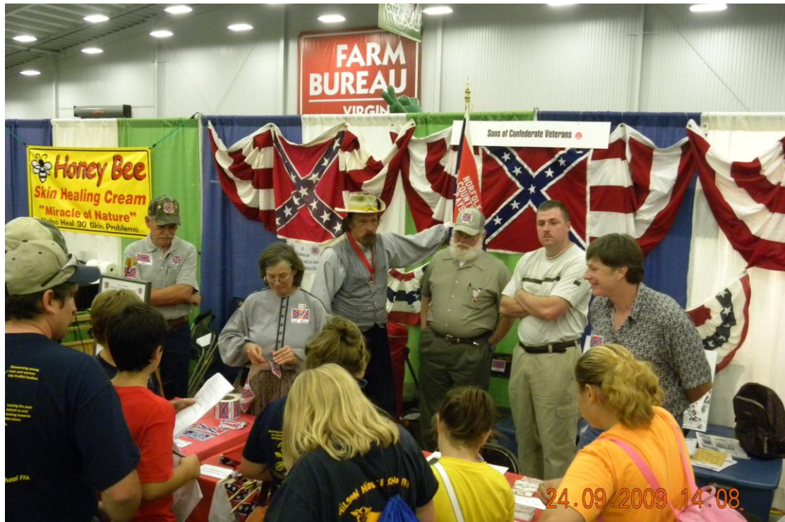
2009 Virginia State Fair