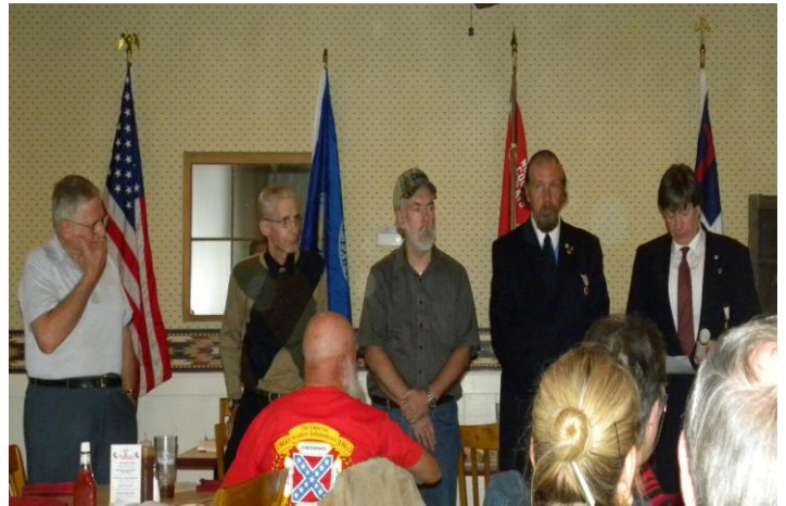
2009 Camp Awards Meeting