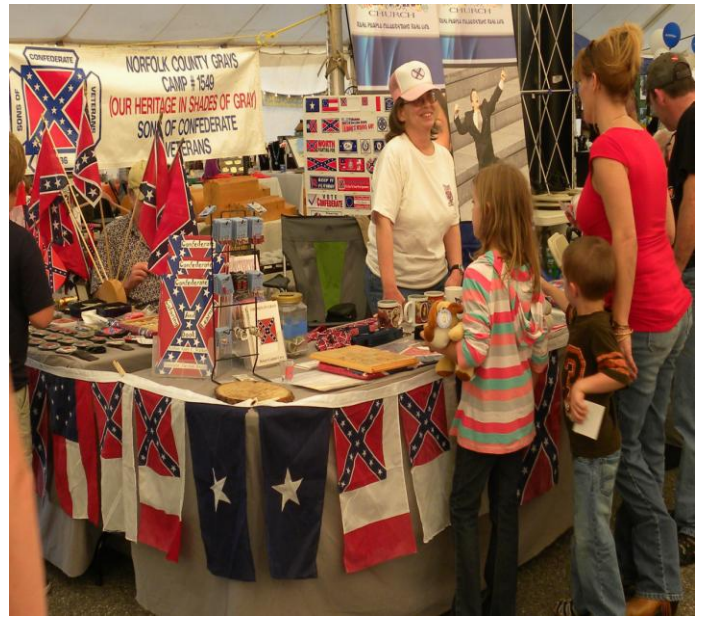
2009 Peanut Festival