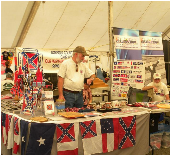
2009 Peanut Festival