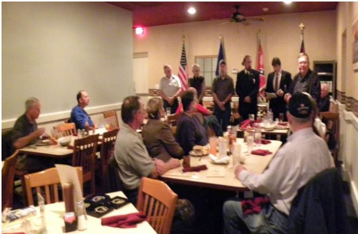
2009 Camp Awards Meeting