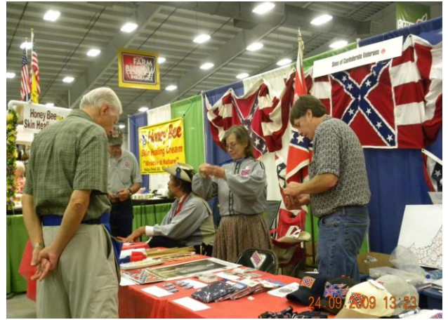
2009 Virginia State Fair