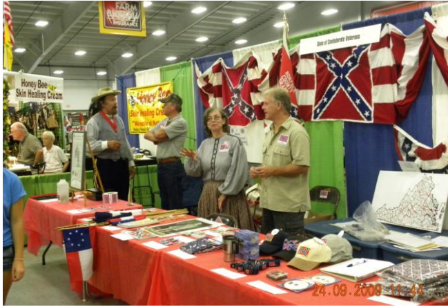
2009 Virginia State Fair

During the next few months, the Newsletter will include pictures made available to the camp by members. If you have photos that can be loaded electronically, please contact Kent Haskett (k_haskett@cox.net) so that he can obtain copies which will be included in future newsletters.